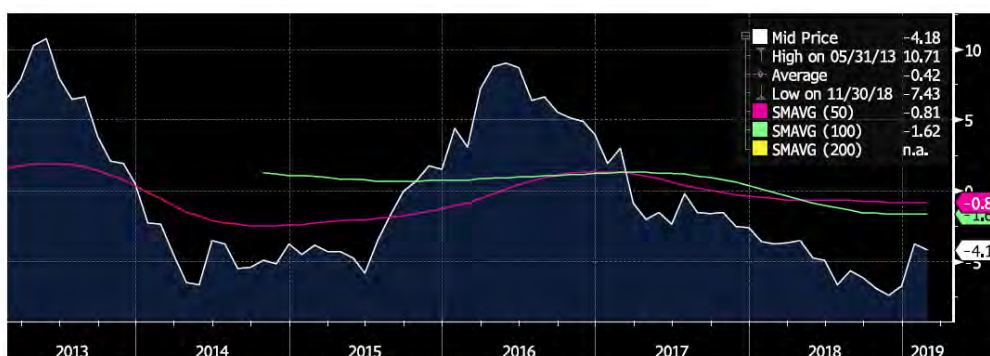
Chart 6. Chinese Credit Impulse Index

Recently, there are some signs that the stimulus is having an impact. The Chinese Credit Impulse Index (see Chart 6 below), which measures the amount of credit that has been created as a percentage of GDP over the past twelve months, has picked up. Historically, this index has been a good forward indicator of China's future growth trajectory.