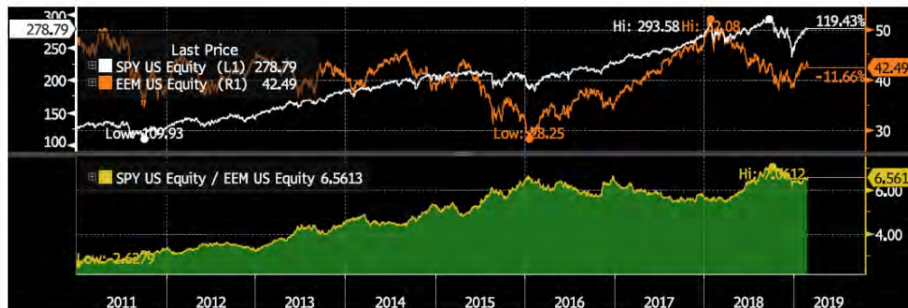
Chart 2. iShares MSCI Emerging Markets Index (EEM) vs. SPDR S&P 500 ETF (SPY) — Jan. 2011-Feb. 2019