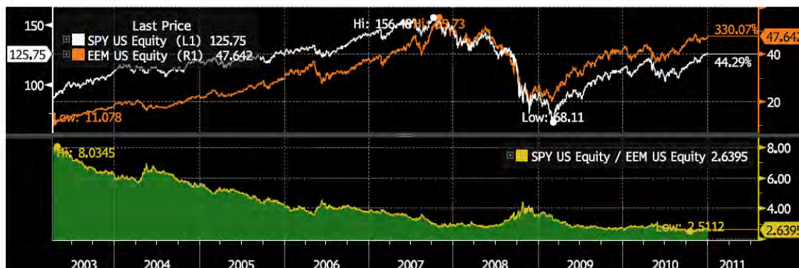
Chart 3. iShares MSCI Emerging Markets Index (EEM) vs. SPDR S&P 500 ETF (SPY) — Apr. 2003 to Dec. 2010

Chart 3 below shows that in the time period before 2011, the opposite occurred, but with even a larger magnitude of outperformance. From April 2003 (inception date of EEM) through 2010, EEM outgained SPY by 285% in cumulative returns.