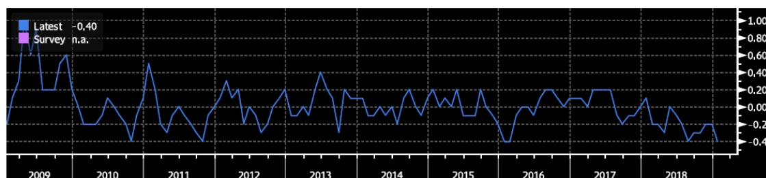
Chart 7. South Korea Cyclical Component of Leading Index

The Korean stock market has been a laggard of late, with a 12 month return of -10.03% (through 3/28/19). The downturn in global growth and global trade has had an outsized impact on Korean stocks. As of yet, there are few signs of a pickup in the Korean economy. Its manufacturing PMI continues to drop. Also, the South Korea Cyclical Component of Leading Index is negative and trending the wrong way, as depicted in Chart 7 below: